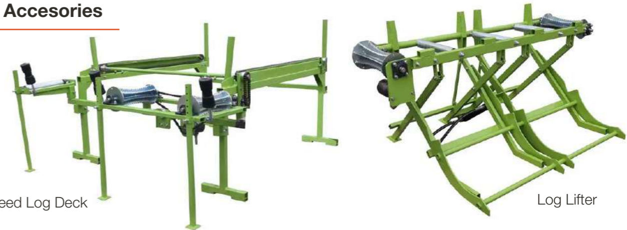
Chain infeed Log Deck